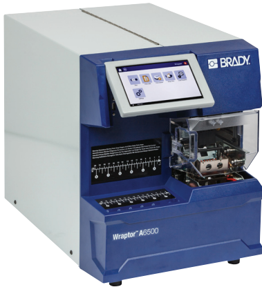
Wraptor™ A6500 WIRE ID PRINTER APPLICATOR