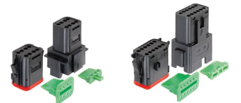
8-Circuit ML-XT™ System