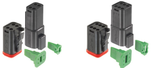
4-Circuit ML-XT™ System