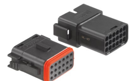
18-Circuit ML-XT™ System